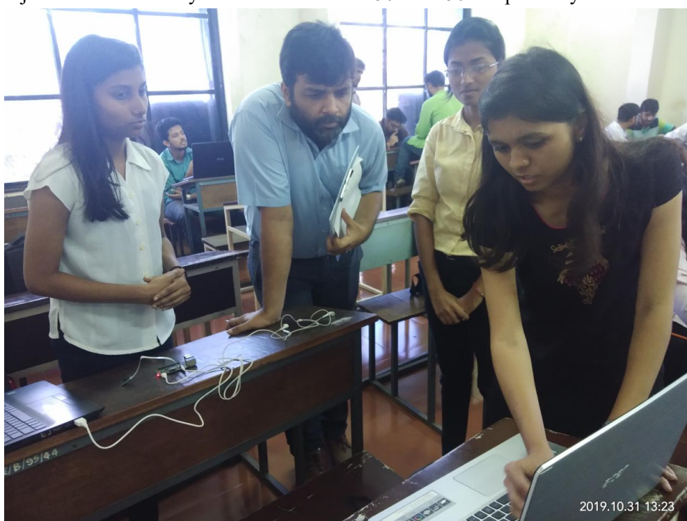
Photograph 4: Project Demonstration in 501