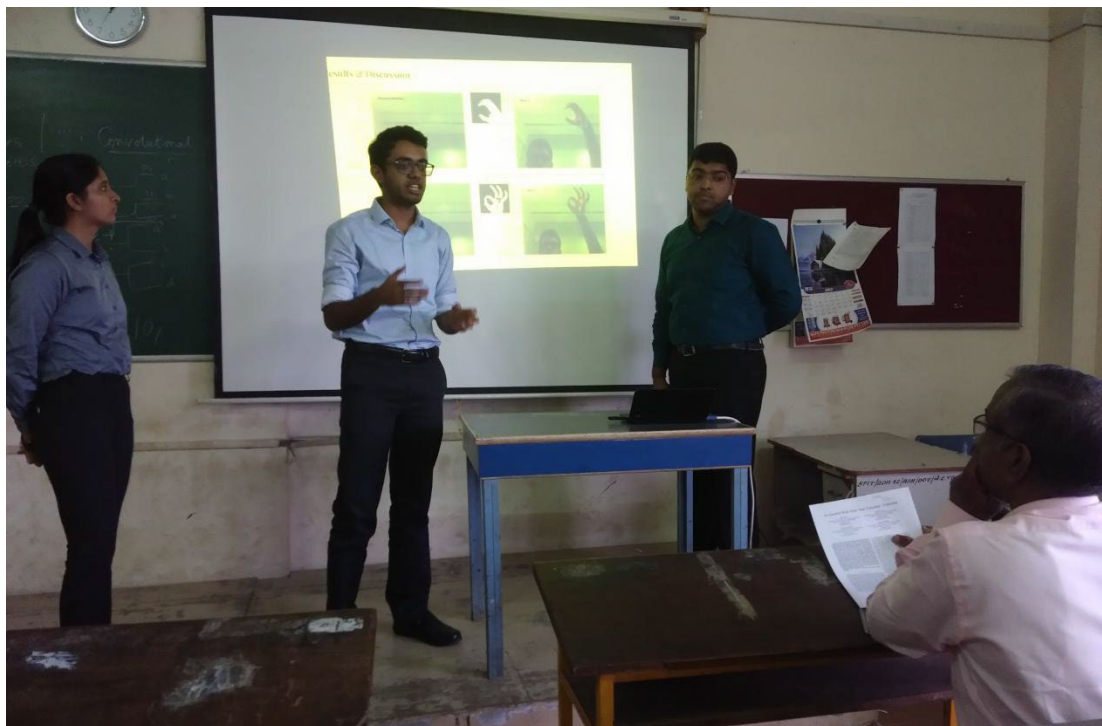
Photograph 2: Paper Presentation held in 505