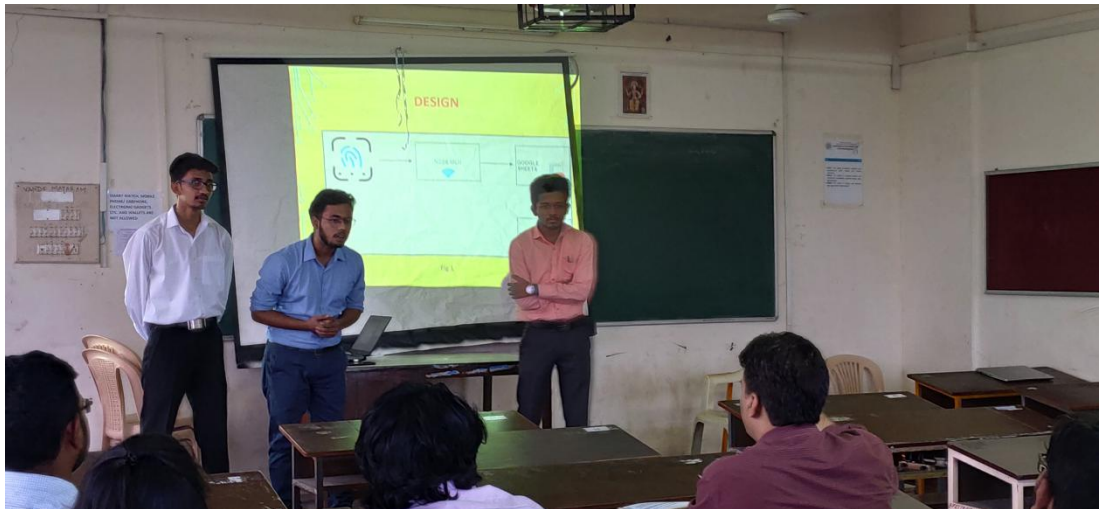
Photograph 1: Paper Presentation held in 501.