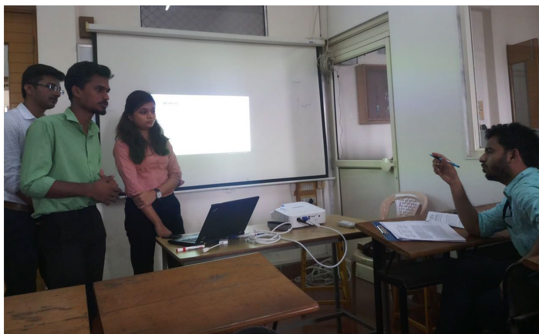
Photograph 3: Paper Presentation held in 507

Evaluation of Paper Presentation was done based on the parameters finalized by R & D students coordinators. Assessment was also carried out on technical paper writing skills of students and suggestions were given to them.