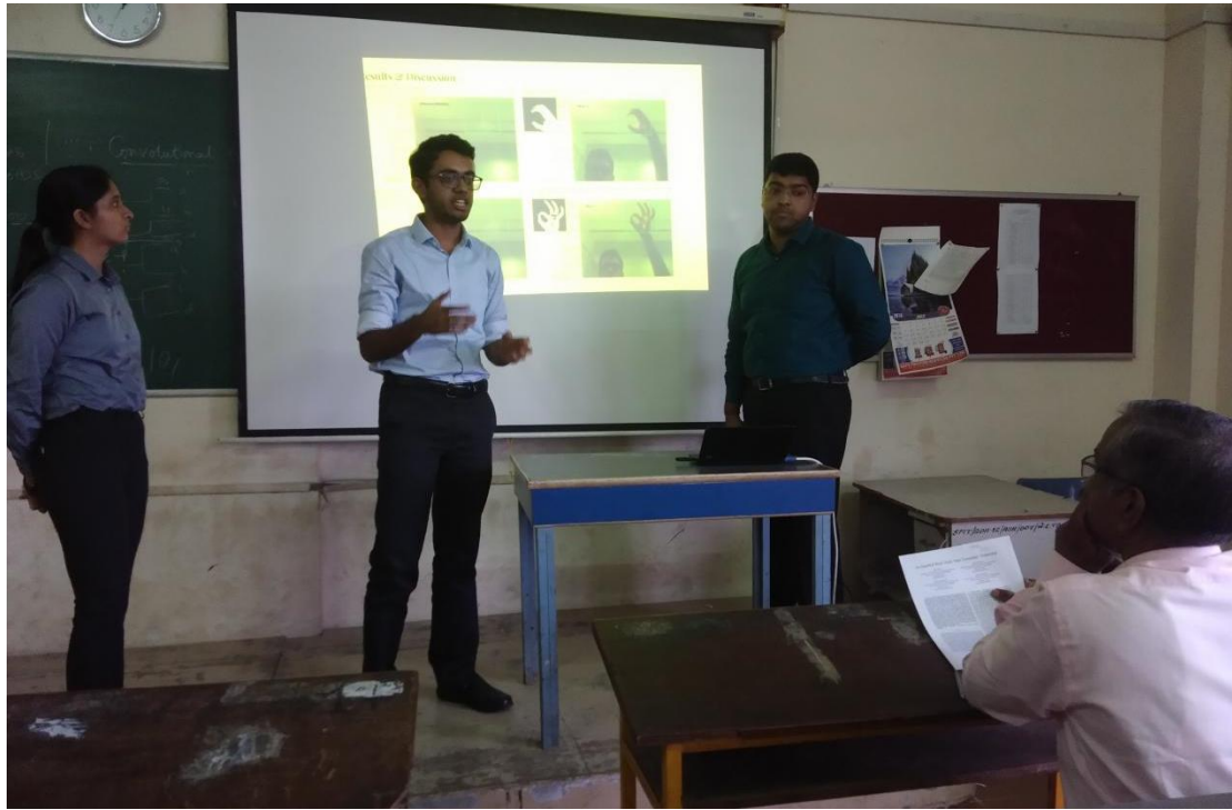
Photograph 2: Paper Presentation held in 505