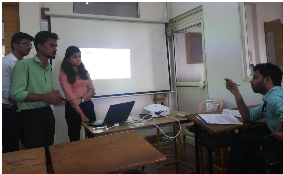
Photograph 3: Paper Presentation held in 507

Evaluation of Paper Presentation was done based on the parameters finalized by R & D students coordinators. Assessment was also carried out on technical paper writing skills of students and suggestions were given to them.