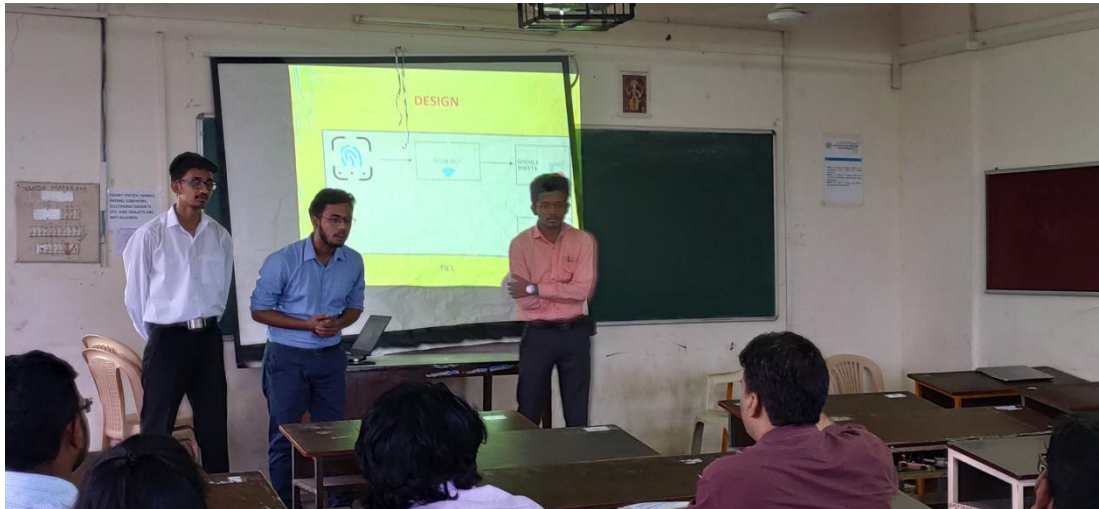
Photograph 1: Paper Presentation held in 501.