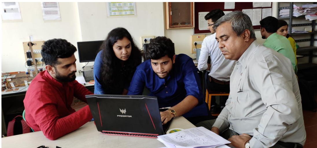
Photograph 5: Project Demonstration in 504