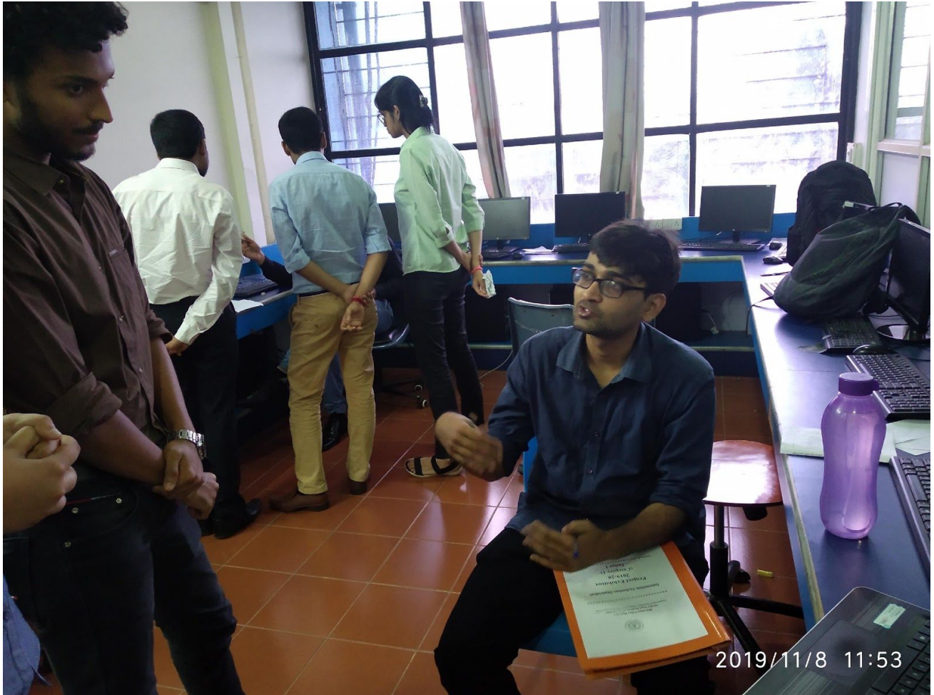
Another group exhibiting their project to judges