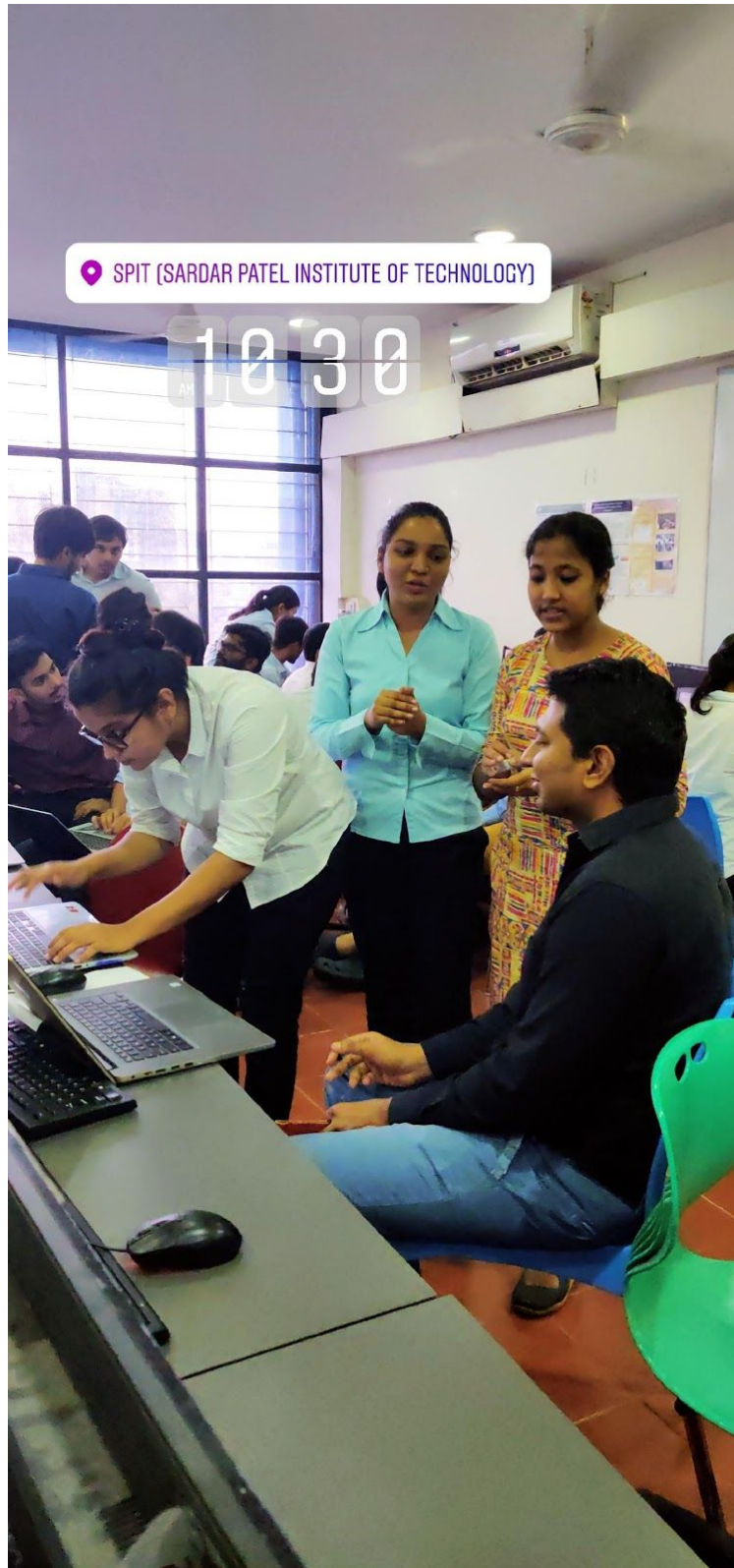
A project group presenting their project

The photos of the event are given below.