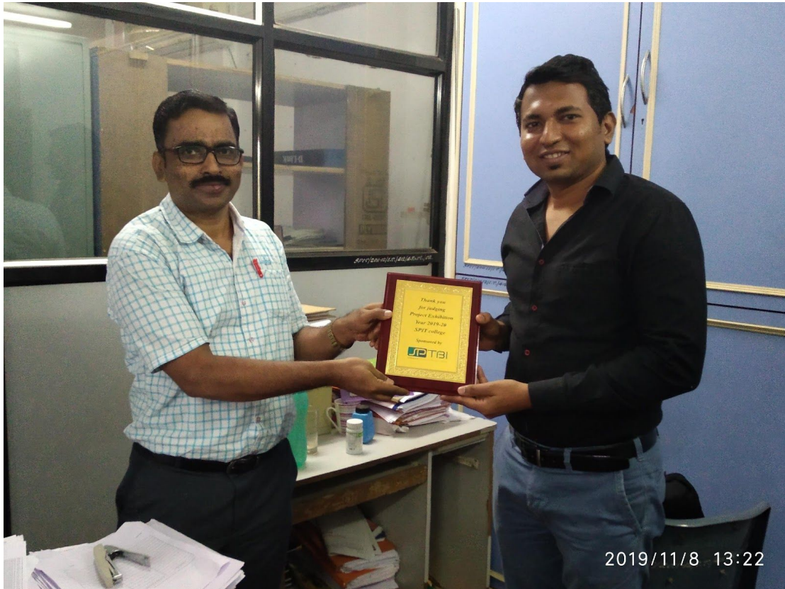
Dept. felicitating one of the judges