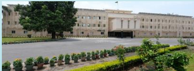
IIRS Main Building

The Indian Institute of Remote Sensing (IIRS) is a constituent unit of Indian Space Research Organisation (ISRO), Department of Space, Govt. of India. Since its establishment in 1966, IIRS is a key player for training and capacity building in geospatial technology and its applications through training, education and research in Southeast Asia. The training, education and capacity building programmes of the Institute are designed to meet the requirements of Professionals at working levels, fresh graduates, researchers, academia, and decision makers. IIRS is also one of the most sought after Institute for conducting specially designed courses for the officers from Central and State Government Ministries and stakeholder departments for the effective utilization of Earth Observation (EO) data. IIRS is also empaneled under Indian Technical and Economic Cooperation (ITEC) programme of Ministry of External Affairs, Government of India providing short term regular and special courses to international participants from ITEC member countries since 2001.