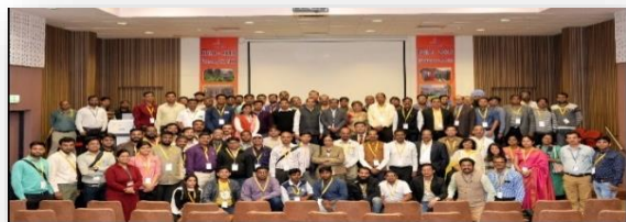
IIRS Outreach programme feedback session during IIRS Academia Meet (IAM)-2020

IIRS has conducted workshops and sessions during IIRS User Interaction Meet to take feedback from participating institutions to improve the quality of future courses.