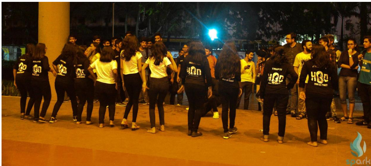
A flash mob performance by the H.O.D. team at the Freshers' Party.