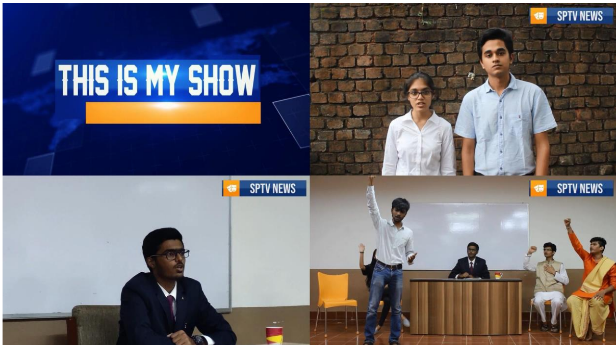
This Is My Show - Mudra's first production(short film).