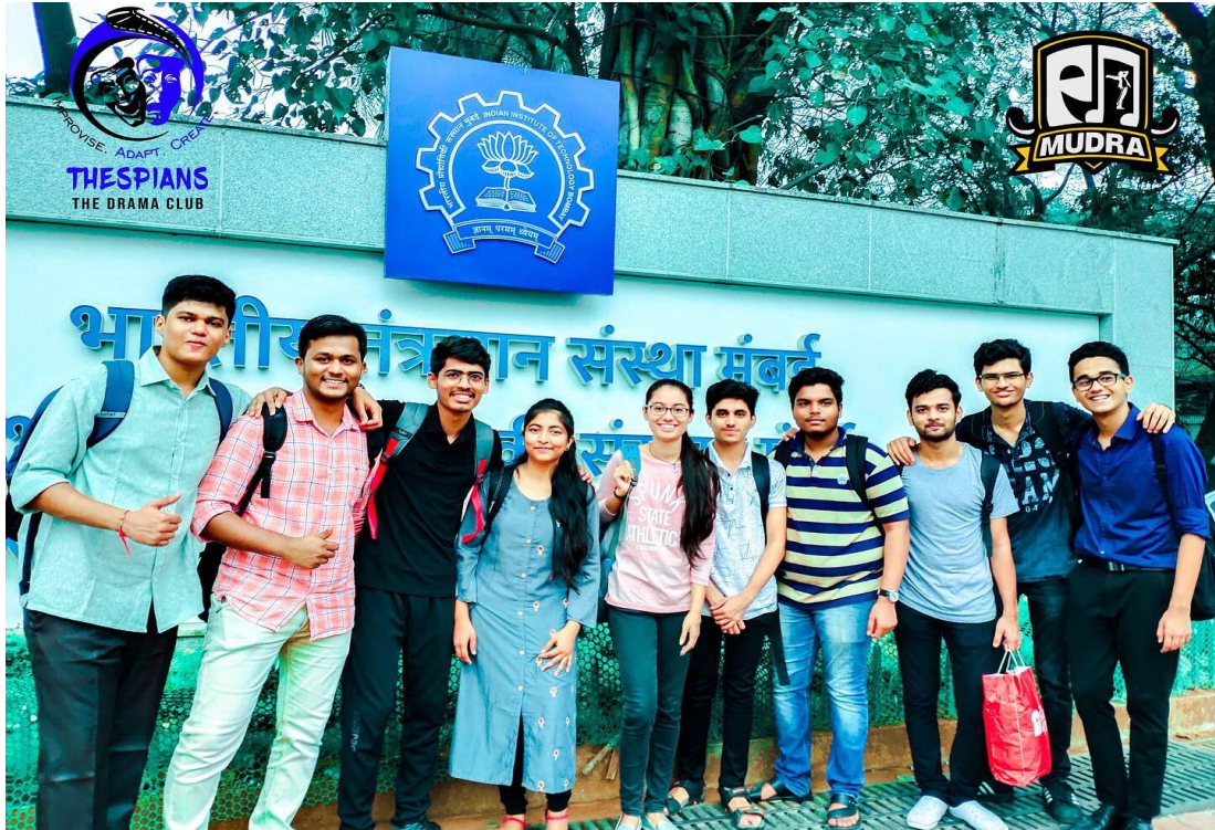
The Drama Club after their IIT-Bombay's Mood Indigo performance

Bhavan's Campus, Munshi Nagar, Andheri (West), Mumbai-400058-India (Autonomous Institute Affiliated to University of Mumbai)