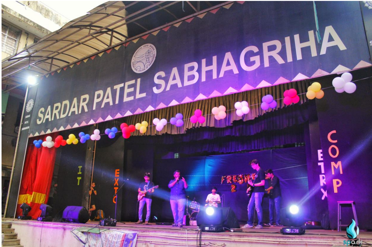
Band performance at the Freshers' Party.